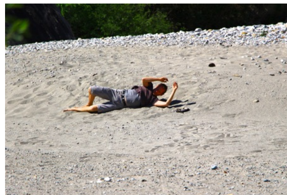
working in the nature