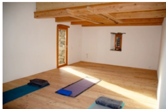
working in the movement space