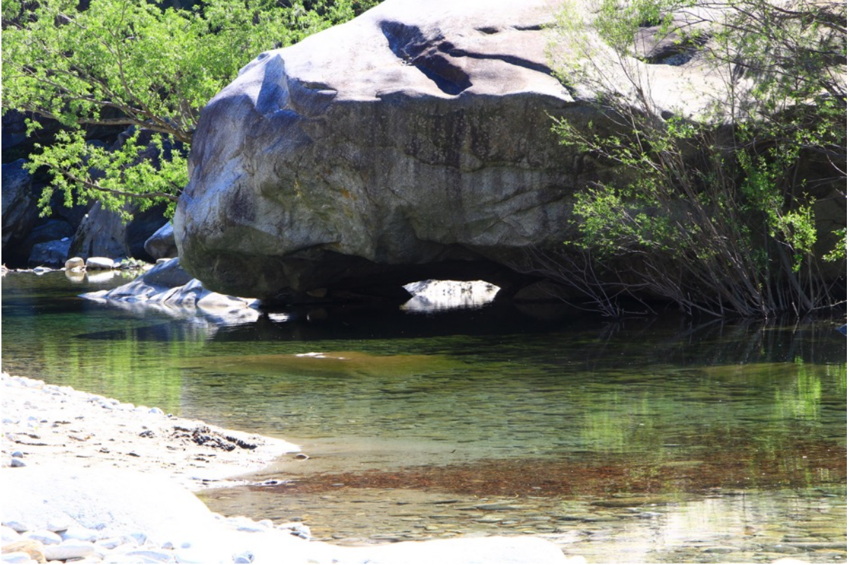
the river Maggia