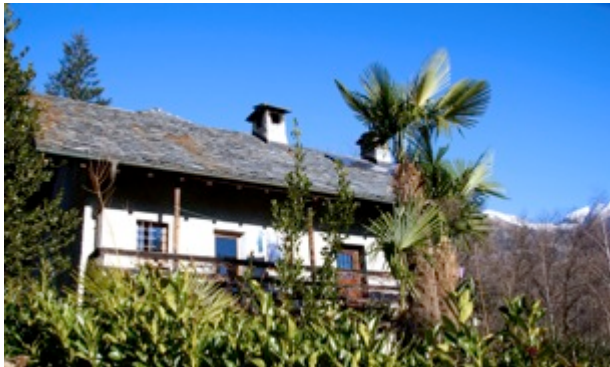
Casa Lucciola from south

The Casa Lucciola is a charming Rustico on a sunny plateau, situated in the middle of a superb landscape in the lower Maggia Valley. The former farmhouse and a small but beautiful moving space welcome inspired people to a variety of activities: dance, music, meditation, walking, swimming, relaxing. The house is simple but comfortable. People sleep in a 4 bed room and prepare the meals together in order to keep the costs low.