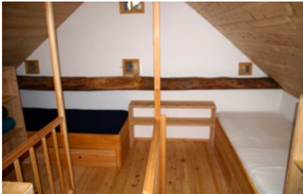
sleeping on the gallery